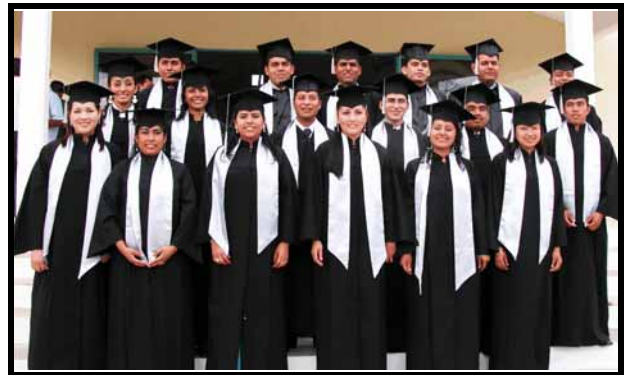
Class of 2010