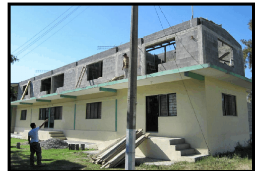
New Dorms for Married Students

The 3 new married apartments are going up. Next week we put the roof on. Then the finishing work will begin. We still lack $37,000.00 to finish the apartments. There are 6 couples with applications already in, preparing to come next September. If we are unable to finish the apartments, we will only be able to accept 3 couples, as there will be no place to house them. Pray that God will meet the need. Two families will be entering in January, but will be living in town.