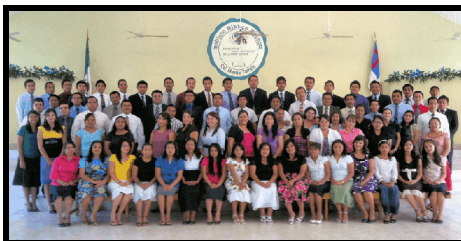
Student Body I.B.B.

We have 76 studying for the ministry in the Bible College; these are our future pastors, missionaries and workers for our churches. In 2½ weeks we will finish the first semester and then Christmas break. During this special season, many of our students will be home with the opportunity to witness and win their lost loved ones. Also, the churches will be having special Christmas programs and services. Pray that God will give an abundant harvest of souls during this Christmas season.