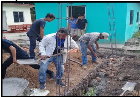
SS Classroom Construction

We look forward to the new school year 2020 – 2021 in the Bible College. Plans are being made for the special services September 7-8. Preachers are lined up to preach both days. The students who have been out serving in the Churches after the Bible College dismissed classes will be returning to renew their studies. Pray with us for a good group of new students to take up the banner and begin their preparation for the ministry. Christ said to His disciples, "The harvest truly is plenteous, but the labourers are few; Pray ye therefore the Lord of the harvest, that he will send forth labourers into his harvest." We are aware of the pandemic, the difficulties and government regulations both in Mexico and in the USA that have been imposed on God's people and the churches. However, the harvest is still plenteous, and the laborers are still few. His command is still the same and the need to preach the Gospel is still the same. God is still in control and He has promised to bless His word.