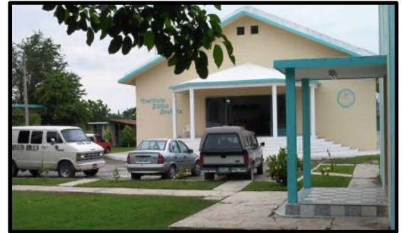
Auditorium Bible College

The work in the Bible College and in the Churches continues forward in spite of the circumstances that the coronavirus has produced. Because of government regulations and rules, physical presence is prohibited in some churches, and in others it is limited to a very few. Many of the Churches have had to go to preaching via Zoom, Facebook, YouTube and other means that technology has availed us. Every week the airwaves are filled with the churches declaring the Good News. Souls continue to be saved and baptized as a result. Recently, I had the blessing of preaching via Zoom to a Church pastored by one of our graduates. During these past few days the Churches in Mexico have had the blessing of virtually attending the Hispanic 2020 Conference. It was a blessing hear the preaching and see so many of our graduates along with many members in the Churches in attendance in the conference on Church Unity via Facebook, Zoom and YouTube.